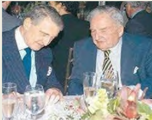
Father and son